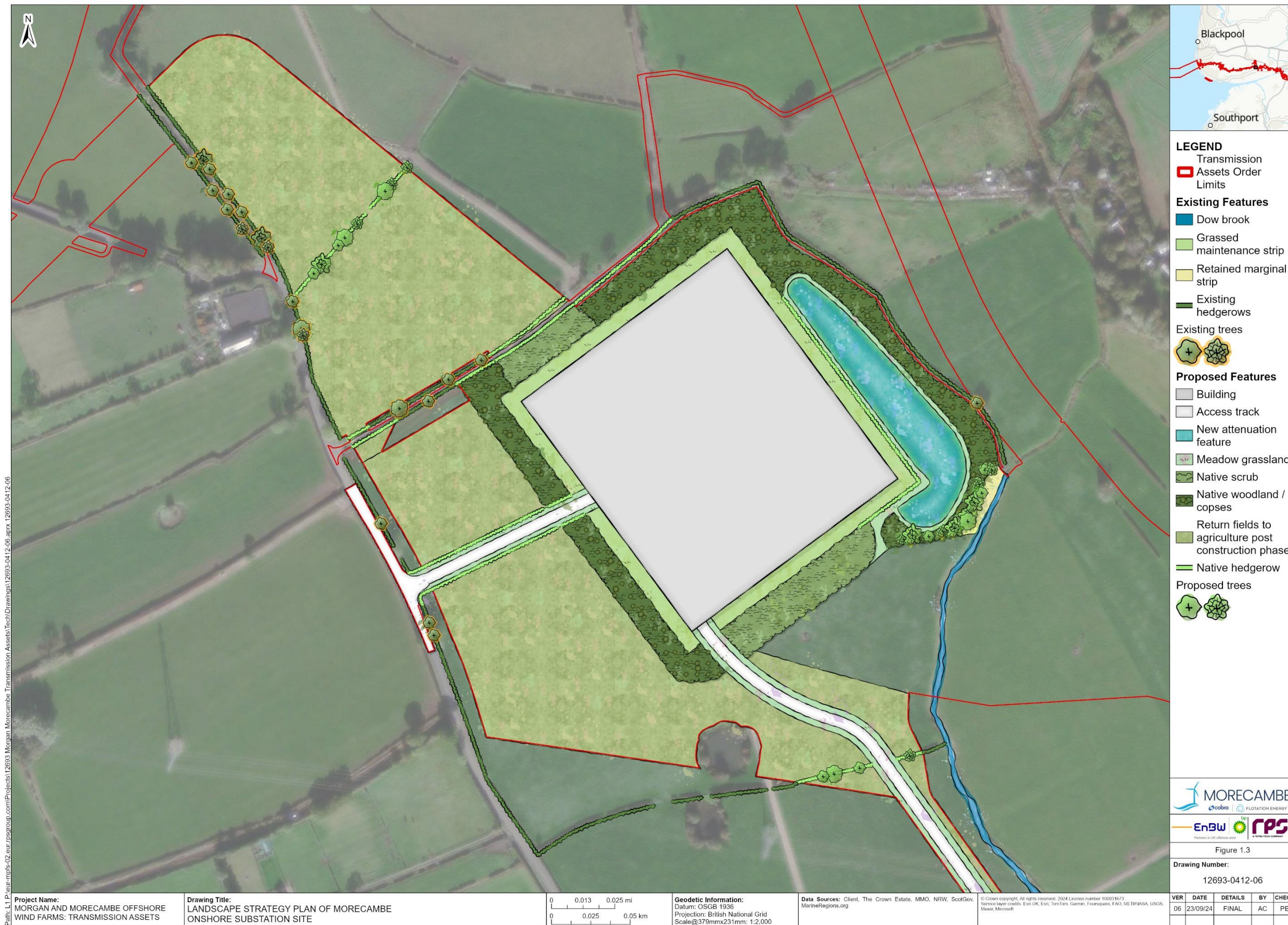
Figure 1.3: Landscape strategy plan of Morecambe onshore substation site