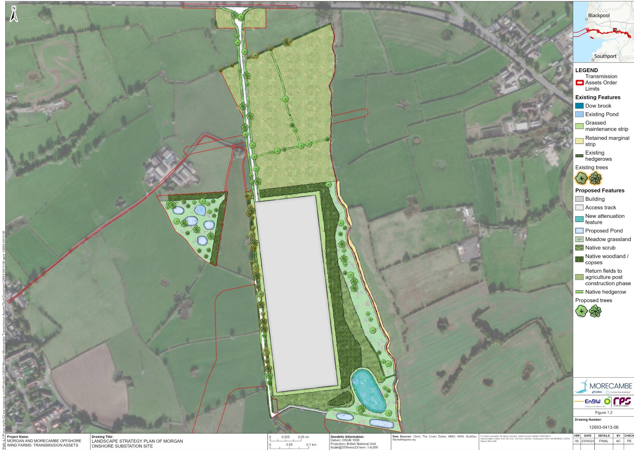
Figure 1.2: Indicative landscape strategy plan of Morgan onshore substation site